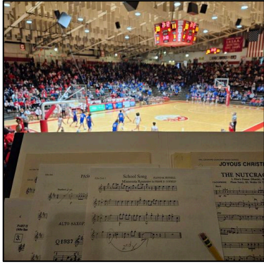
IPA Community Band performed at Spartan Bowl Nov. 22.

The IPA Community Band opened its fall season on Nov. 22 with a pep band appearance at the Spartan men's basketball game in Spartan Bowl.