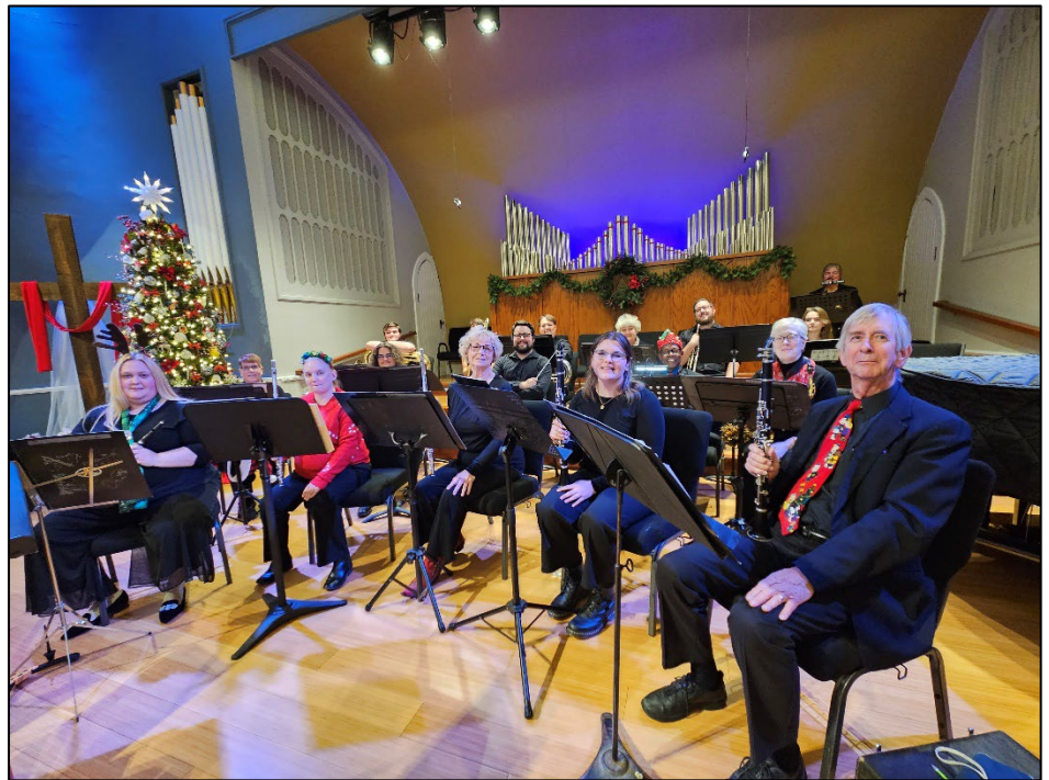
The IPA Community Band.