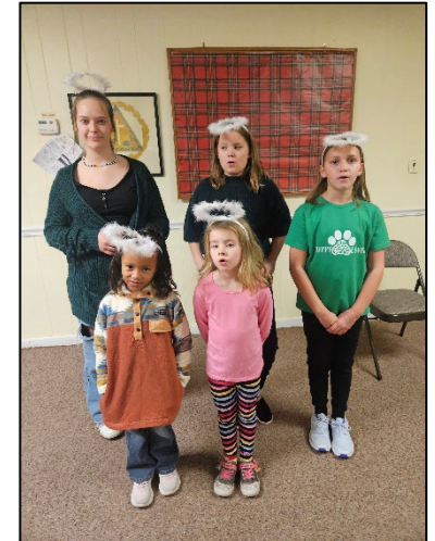
The choir rehearses “Angels We Have Heard on High.”